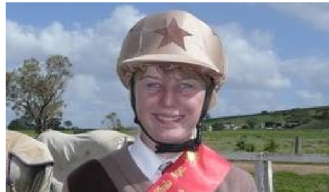
WPC hat cover: $25 for 2 tone plain cover, or $30 for fawn hat with either stars, hearts, lightning bolts or horseshoe pattern.