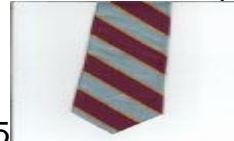
PCAV tie to be worn with woollen jumper $25