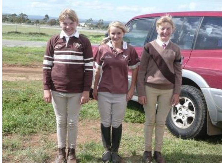
Club Rugby Jumper: $60